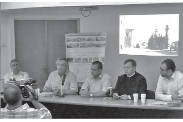
Fig. 8. Press conference held at The Argeș County Museum, July 13, 2007.