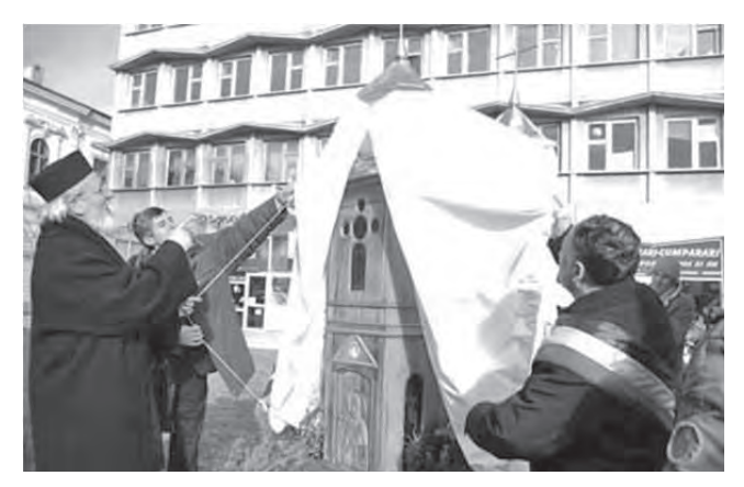
Fig. 10. Unveiling ceremony of a miniature church, December 26, 2008. According to www.centrul-cultural-Piteşti.ro.

in as such by the construction company to the City Council (the beneficiary of the works). Soon a decision should be taken in relation to the possibility of in situ preservation for the church remains (a first for Pitești), an option which – as the local press articles began showing – the City Council tended to make, and to which city residents expressed their enthusiasm and full agreement.