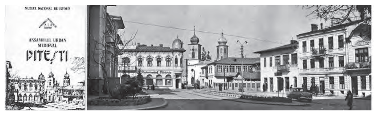
Fig. 2. Greceanu 1982 first cover's artwork (1), reproducing a detail from a photograph taken by Ștefan Butak in 1961 (2).

Large (approximately 25 m x 9 m) single nave type (without side apses), consisting of altar, nave, narthex and an open porch, having two high towers, one above the nave, the other on the porch, St Nicholas Church played an important role in city life. It acted as a cathedral church; on 30 April 1878 the independent Romania's first Te Deum was officiated here, in the presence of Prince Carol I. In the square next to the northern wall of the church, a statue of Ion C. Brătianu was erected around 1905 (sculptor D. Mirea), which was to disappear, too, after 1947. Registered as monument of architecture in 1955, St Nicholas Church did enjoy this status for only seven years, being demolished by the communist authorities in July 1962 for reasons related to the new urban facilities of Pitești.<sup>6</sup>