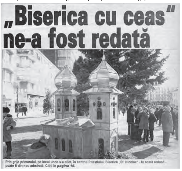
Fig. 13. Press report, "Argeșul" newspaper, year CXXXI, no. 5497, December 29, 2008, p. 1.