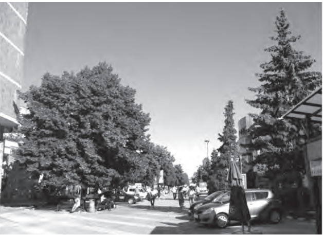
Fig. 16. Pedestrian area under which are the remains of "The Town Clock Church", immediately before the start of archaeological excavations – June 2007 (1) and at present – June 2011 (2).

media, unanimously fallen in ecstasy: The Town Clock Church has been given again to us (Fig. 13) and The Town Clock Church brought back into Pitești life ("Argeșul", 29 December 2008), St. Nicholas Church was rebuilt in the city center ("Curierul Zilei", 29 December 2008) etc.