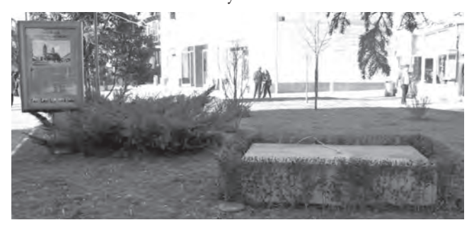
Fig. 15. Empty base, nearby the explanatory panel (April 2011).