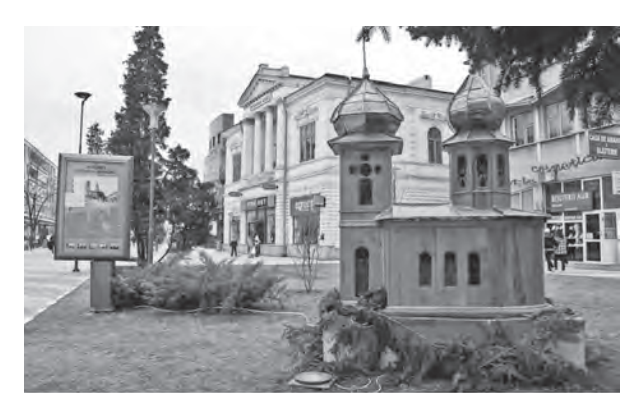
Fig. 11. Miniature church and explanatory panel. Photo by Alex Şerban. According to http://syvantone.blogspot.com.