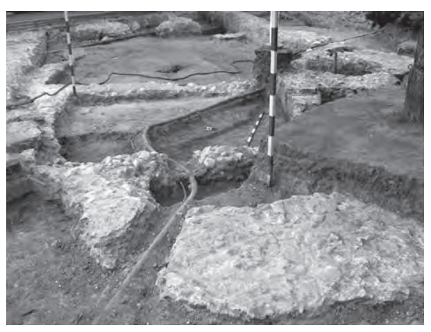
Fig. 4. The foundations of the altar and nave of the churches from 1812 and from the mid eighteenth century, unveiled during the excavations of June-July 2007. View from the west.