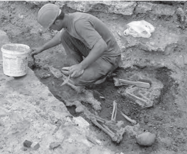
Fig. 6. Research of a grave outside the southern nave wall of the church from 1812.