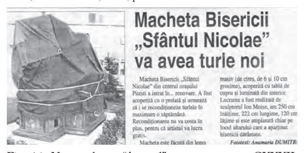
Fig. 14. News release, "Argeșul" newspaper, year CXXXII, October 8, 2009, p. 5.