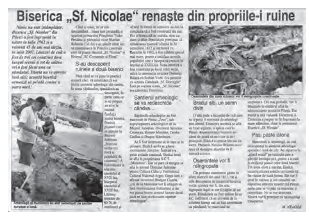
Fig. 7. Press report, "Argeșul" newspaper, year CXXX, no. 5055, June 14-15, 2007, p. 16.