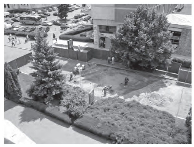
Fig. 3. Discovery of the nave foundations built in 1812.