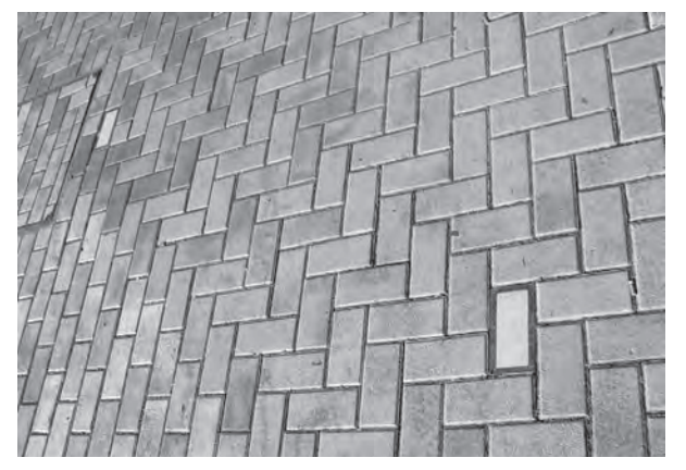
Fig. 9. Spot lights embedded in the actual pavement, on the track of the nave walls of the church from 1812.